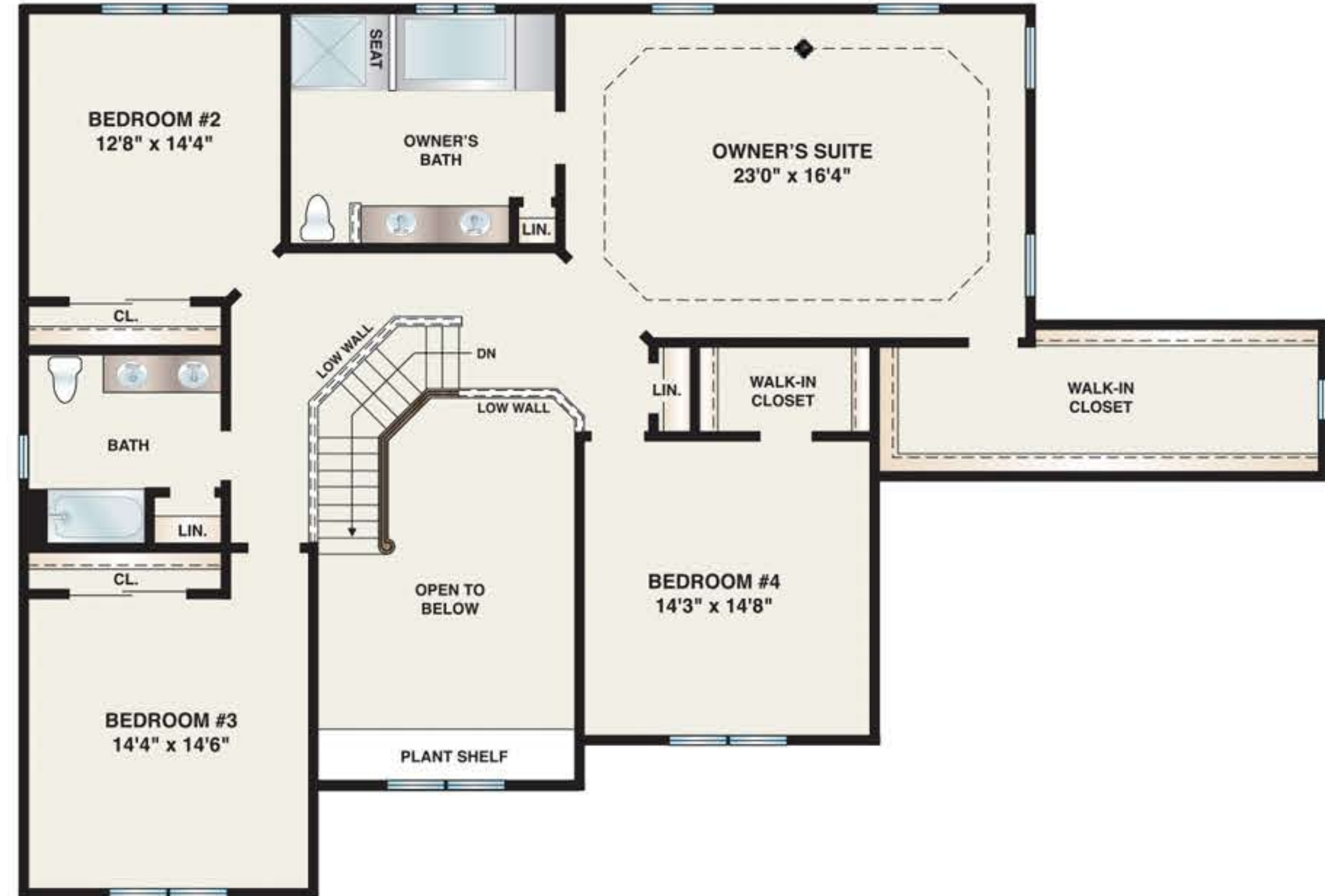
SECOND FLOOR ELEVATION I WATER TABLE