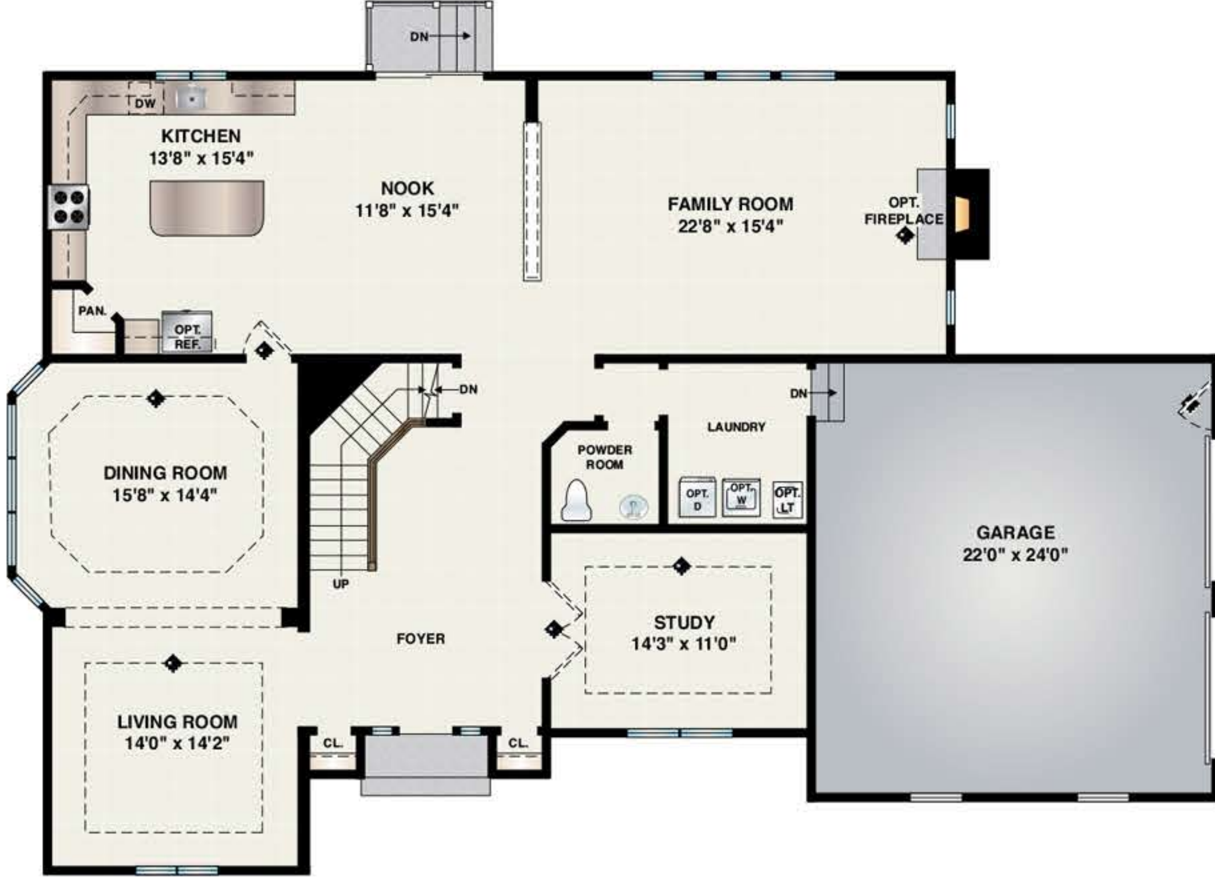
FIRST FLOOR ELEVATION I